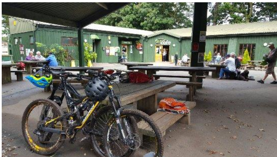
Delamere Forest Visitor's Centre Café

We stopped for another ice cream on the outskirts of Oswestry and after passing through Weston Rhyn we were soon back at the Castle Bistro where we met the other two again. An excellent day we all felt, and a route which we would like to see become a regular in the calendar. For me it was certainly one of the highlights of the year's programme.