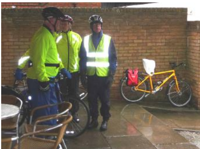
Braving the weather