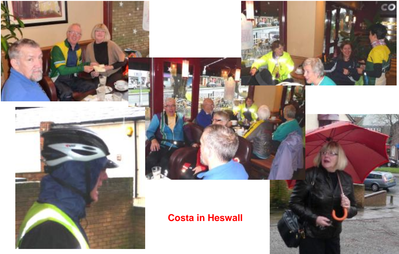
Costa in Heswall

It was pouring down again at ‘decision time’, so we elected to use the car and join the rest of the group at ‘the meet’, which today was at Costa Coffee Shop in Heswall .