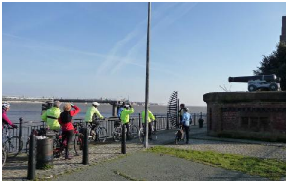
The One O'Clock Gun

Eventually, we left the riverside and headed inland, following the intricate, but quite well signed route after Birkenhead .