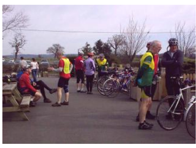
The 'A' team wasn't far behind us and stopped for a quick ice cream.

The Venetian Marina café was reached at midday, where we were made very welcome - our arrival having been prearranged by phone.