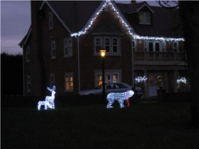
Tasteful in Puddington