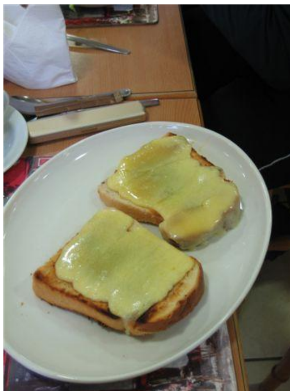
Plain and basic