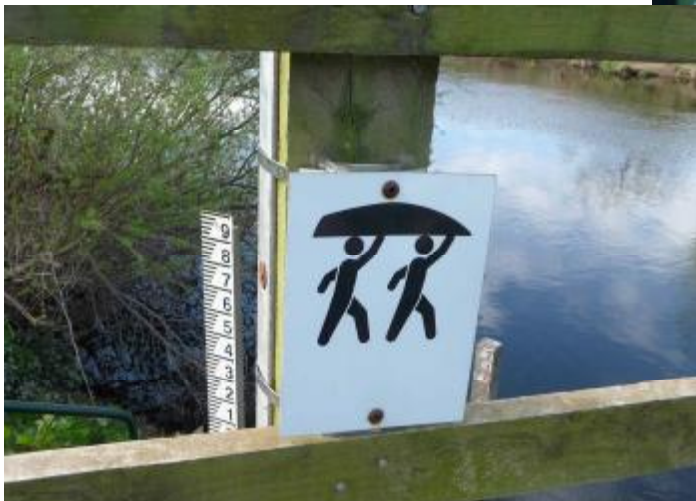
a canoe launching point