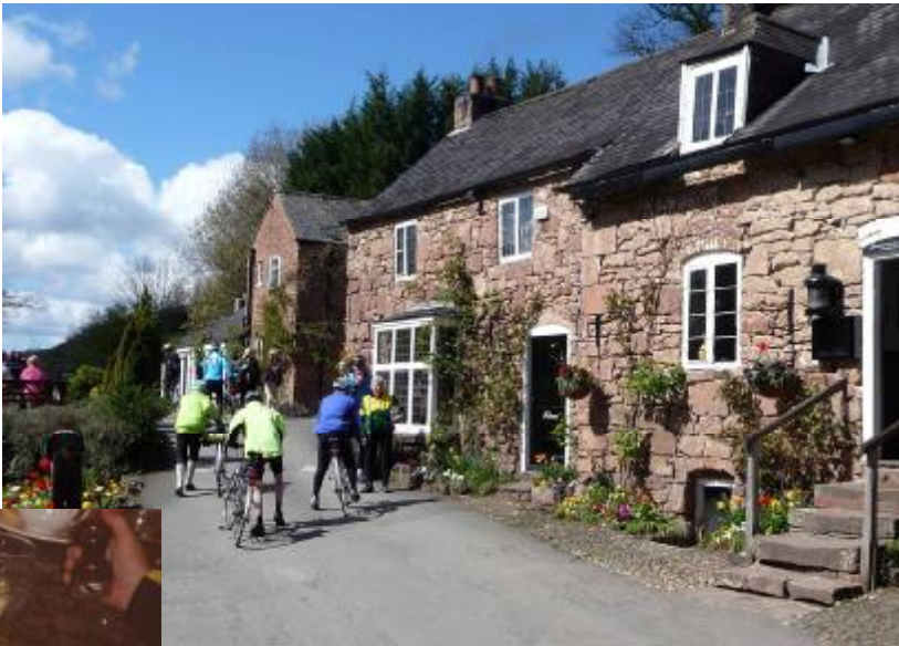
Lunch at the Boat Inn

The landlord said that “We are no longer a restaurant - only a pub. ” Well, we were soon shown to an almost baronial like room and tucking into “ only pub sandwiches”, which were excellent.