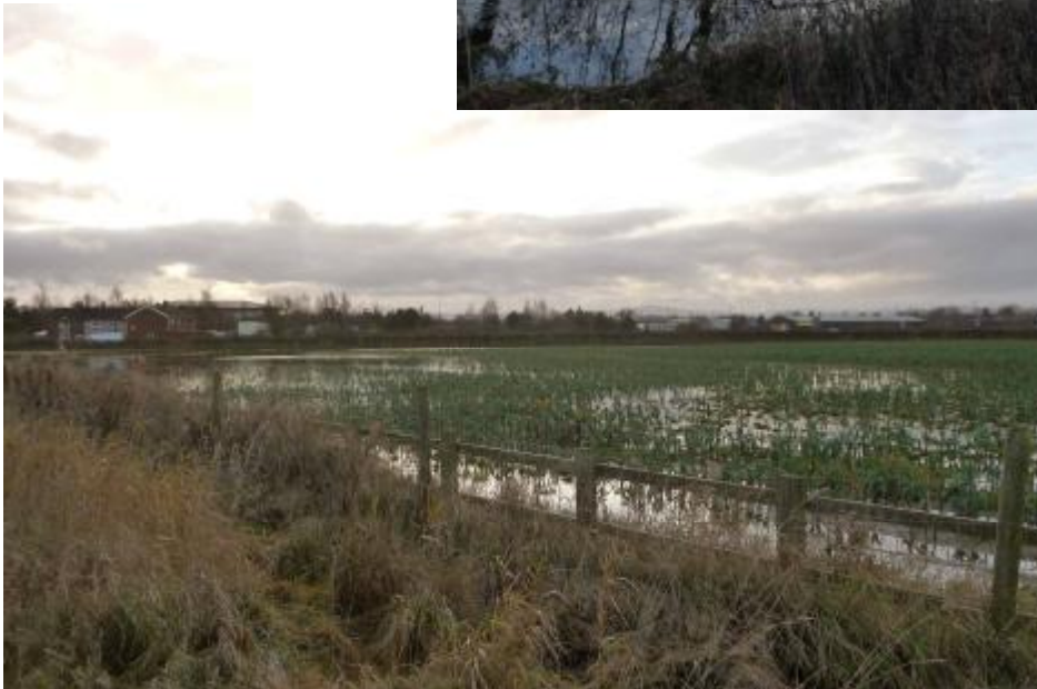
Yet more... waterlogged fields