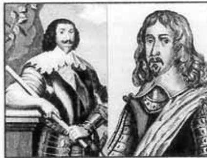
The commanders of Royalist and Parliamentary forces at Chester. On the left Lord John Byron, Royalist, on the right Sir William Brereton, Parliamentarian.