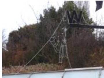
A festive ride in slightly warmer weather