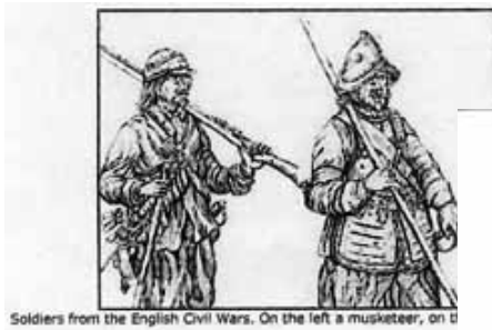
Soldiers from the English Civil Wars. On the left a musketeer, on the right a pikeman.