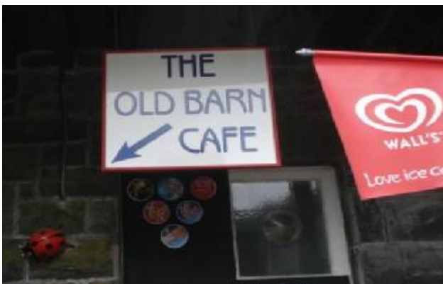
The Old Barn Cafe

A speedy descent followed and lunch was taken at the “Barn” café by the Lake Vyrnwy Visitor Centre.