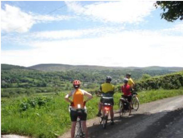
Stopping to admire the view