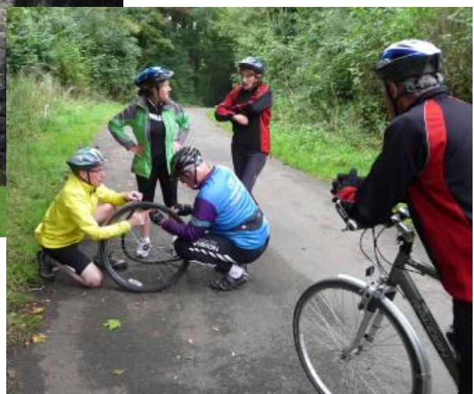
The inevitable puncture