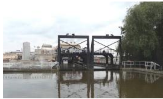
The Anderton Boat Lift

These delays meant that several of us did not get to the Anderton Lift café until nearly 1.30pm. So late in fact that I missed joining the A riders , who had arrived at 12.15pm, lunched at the pub, and I assumed, had left for their long ride home! They did it in two hours (a course record) meaning that they were back before the forecast rain arrived at 5.00pm. For the record, it then rained for twenty-four hours, giving over three inches of rain locally.