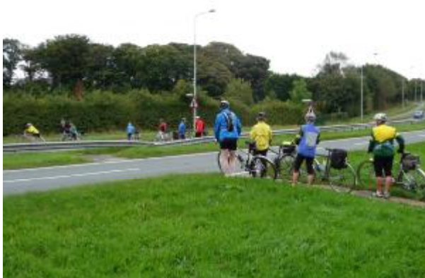
Crossing the A556