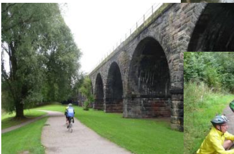
Northwich Railway Viaduct