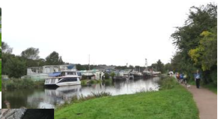
Along the Weaver