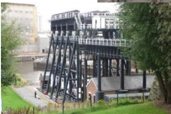
Anderton Boat Lift

The River Weaver , the many railways , used and disused, the several salt works , huge mountains of mined rock salt (ready for the winter roads),