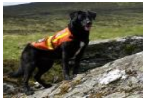
Search and Rescue Dogs

Sponsorship and donations for the event will SUPPORT THE RESCUE SERVICES