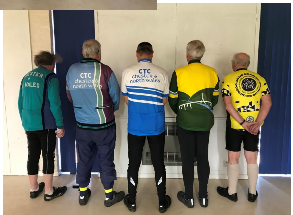
Vintage Kit back