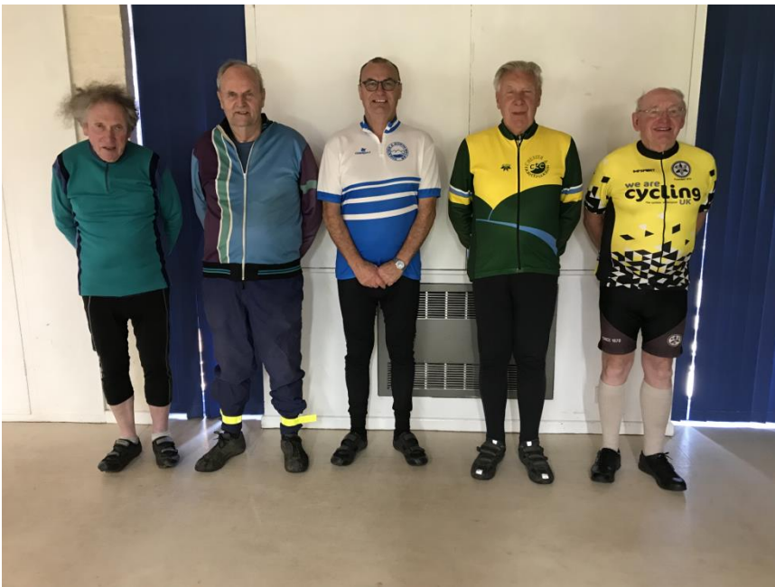
Vintage Kit Front

There was an amusing interlude when five riders present who were wearing various versions of Club Kit over the decades were identified and lined up for a photo call. There was laughter as comments such as "it looks like an identity parade", and "they look like they're in the loo" when they turned to display the rear view!