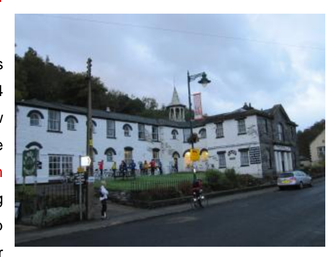
Start of the Barmouth Boulevard at 8.00am

Thirteen riders started and 11 finished this demanding ride in times ranging from 10:44 to 12:40 hours. One rider had fitted a new chain on his bike without changing the sprockets. By the time he got to Barmouth "swarf and sparks" were flying from inner ring and cogs, which necessitated a direct limp back to Corwen; a brave effort with over 170km ridden.